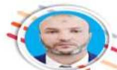
Aiyad Gannan Gas Turbine Degradation