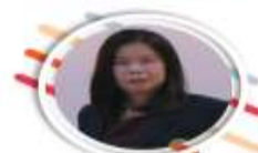
Suminya Teeta Effect of Microwave Power and Puffing Time on the Quality of Yam Bean Cracker