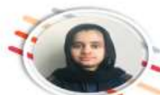
Fathima Zara Integrating Virtual Reality as a VLE with Education of Disabled Students and It's Procedure and History