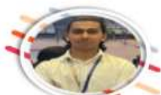
Mythreya Hardur Madhukeshwara Deep Learning-Based Cancer Classification from DNA Sequences: Prediction using End-to-End Neural Networks without feature selection