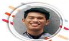
Visuwat Malai Tensegrity Structures In Contemporary Design: Exploring the Interplay of Art and Engineering for Aesthetic Appeal, Structural Efficiency, and Sustainable Innovation